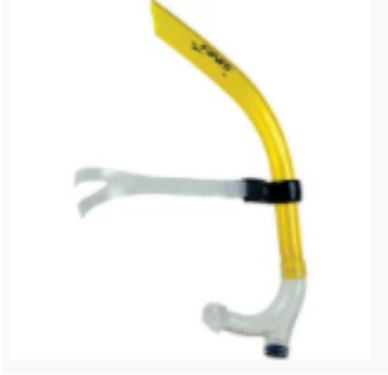
FINIS swimmer snorkel