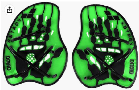
Arena Power Paddles