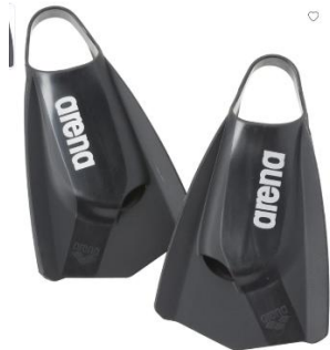
Arena Powerfin Pro Swim Fins