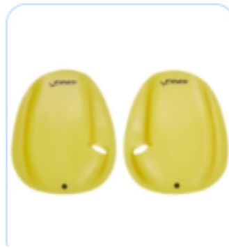
FINIS Agility Paddles floating